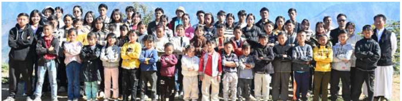
Sharing: January - March 2026