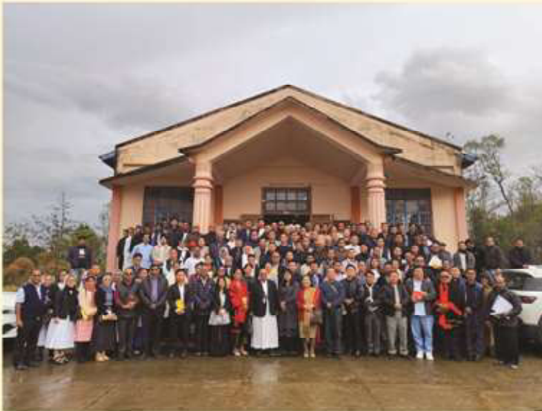
DPC Meeting at Mount Tabor, Kohima on 13 th March, 2026