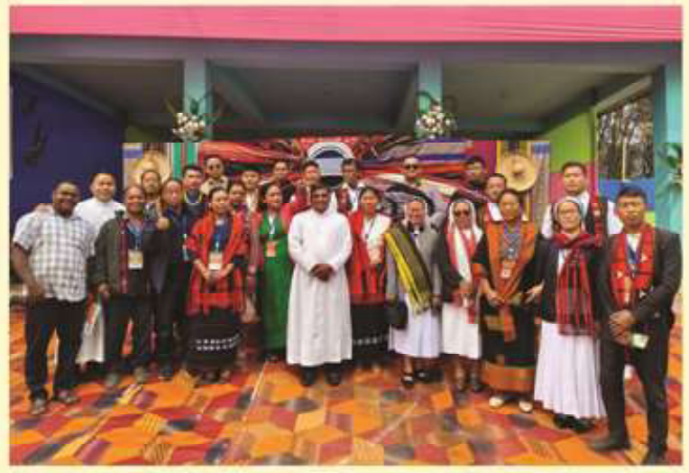
Kohima Diocese Representatives at the BEC Silver Jubilee of NE at Byrnihat on 1 st Feb, 2026.