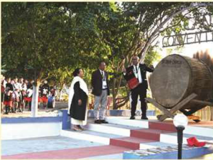
CAN Convention at Jalukie, 10 th Jan, 2026