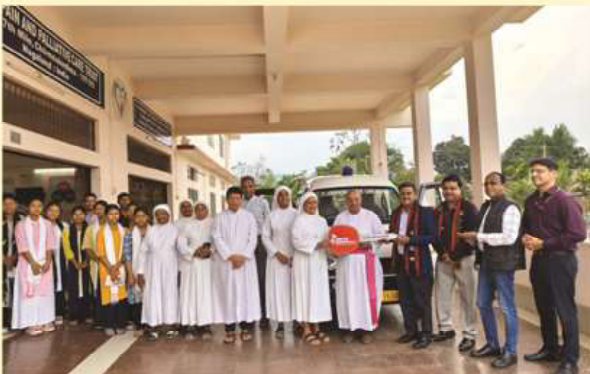
Blessing of New Ambulance of St. Joseph Palliative Care Center Chümoukedima, Spon- sored by South Indian Bank on 18 th March, 2026